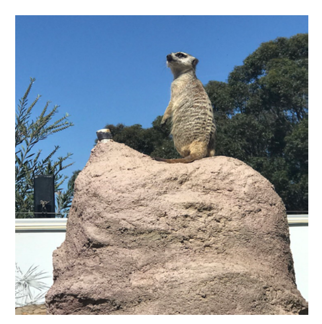
More Images can be viewed on the Club Facebook Page.