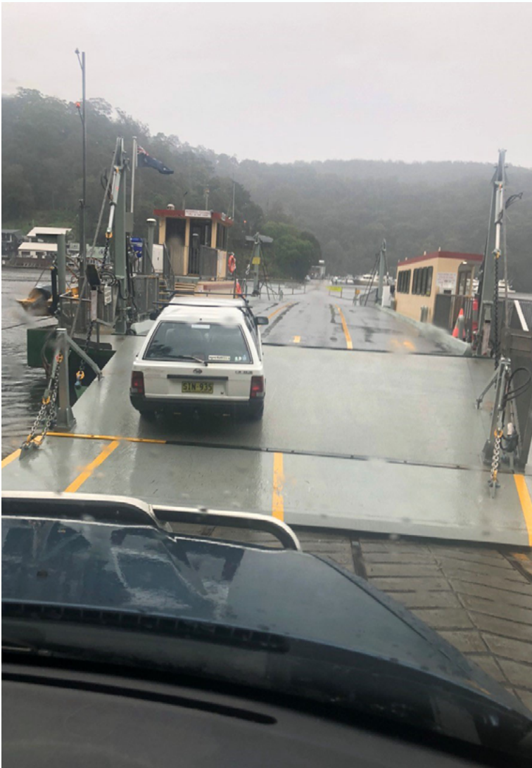
Entry onto the Berowra Water Ferry