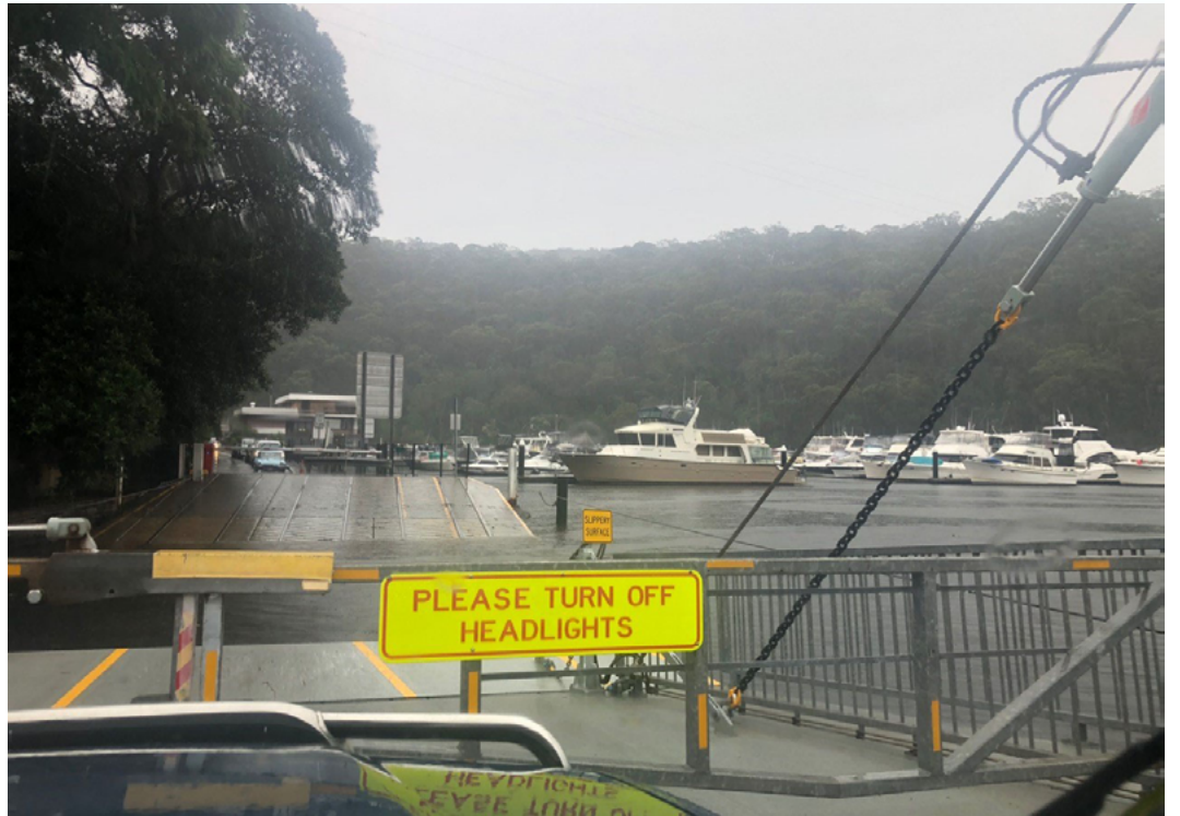
Exiting the Berowra Water Ferry