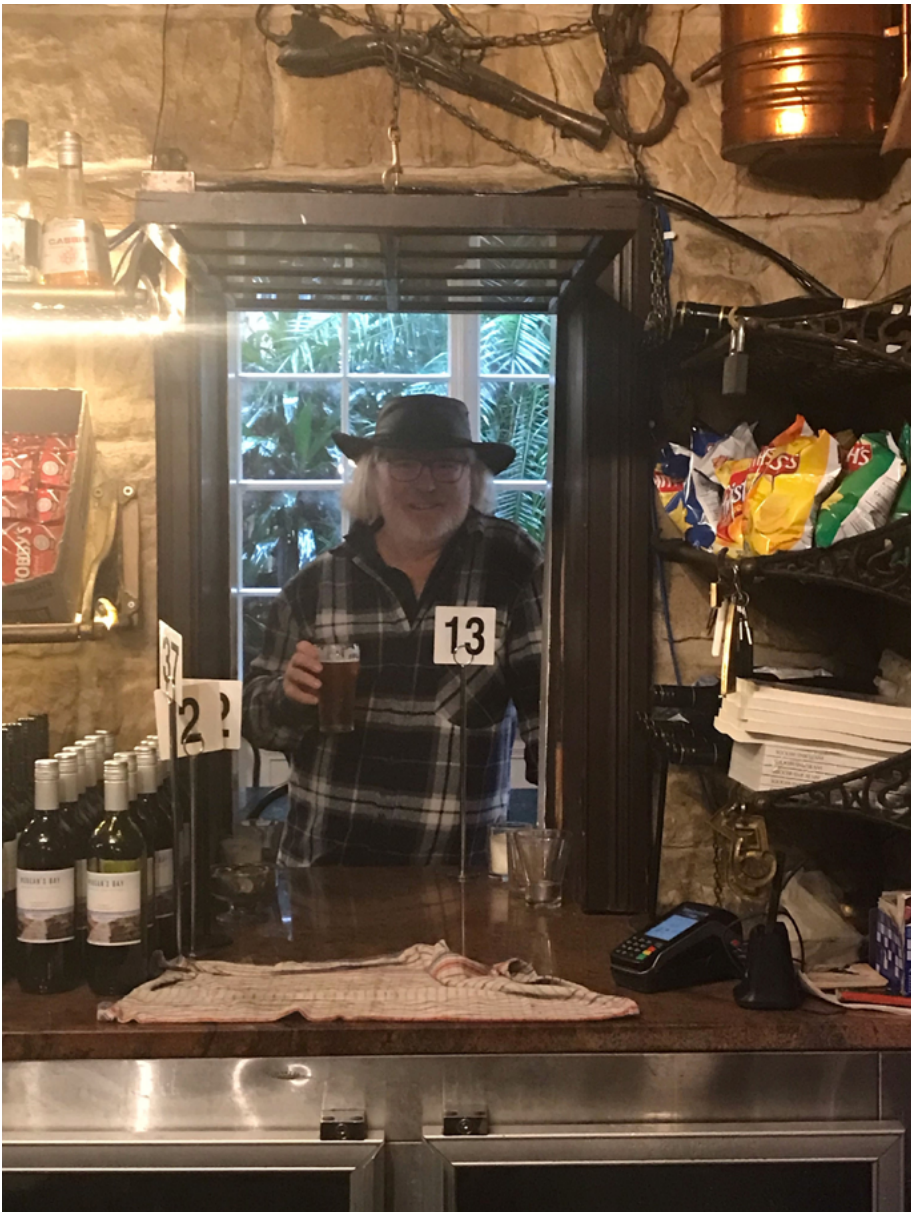
Number 13 - unlucky for some and a cold beer for others.