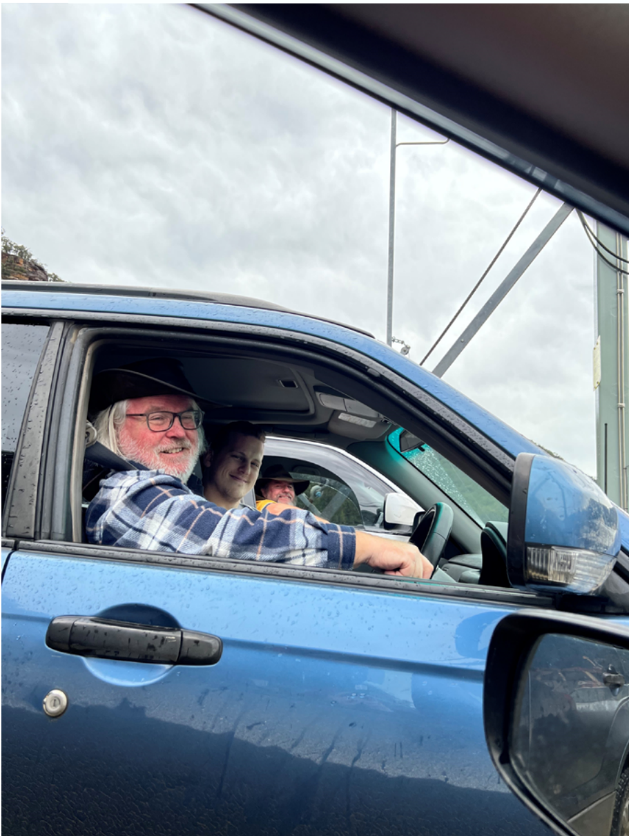
The gang crossing the Hawkesbury on a punt