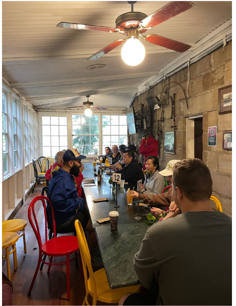
The trip mob at lunch at Settlers Arms at St Albans