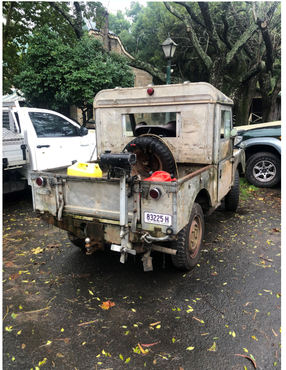
A historic Landy at St Albans